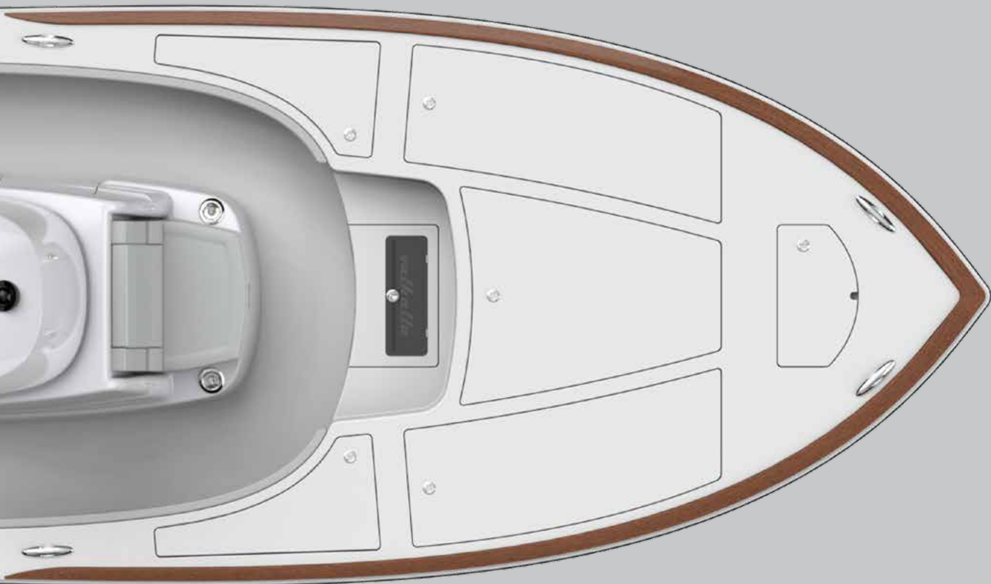
Standard Deck Arrangement