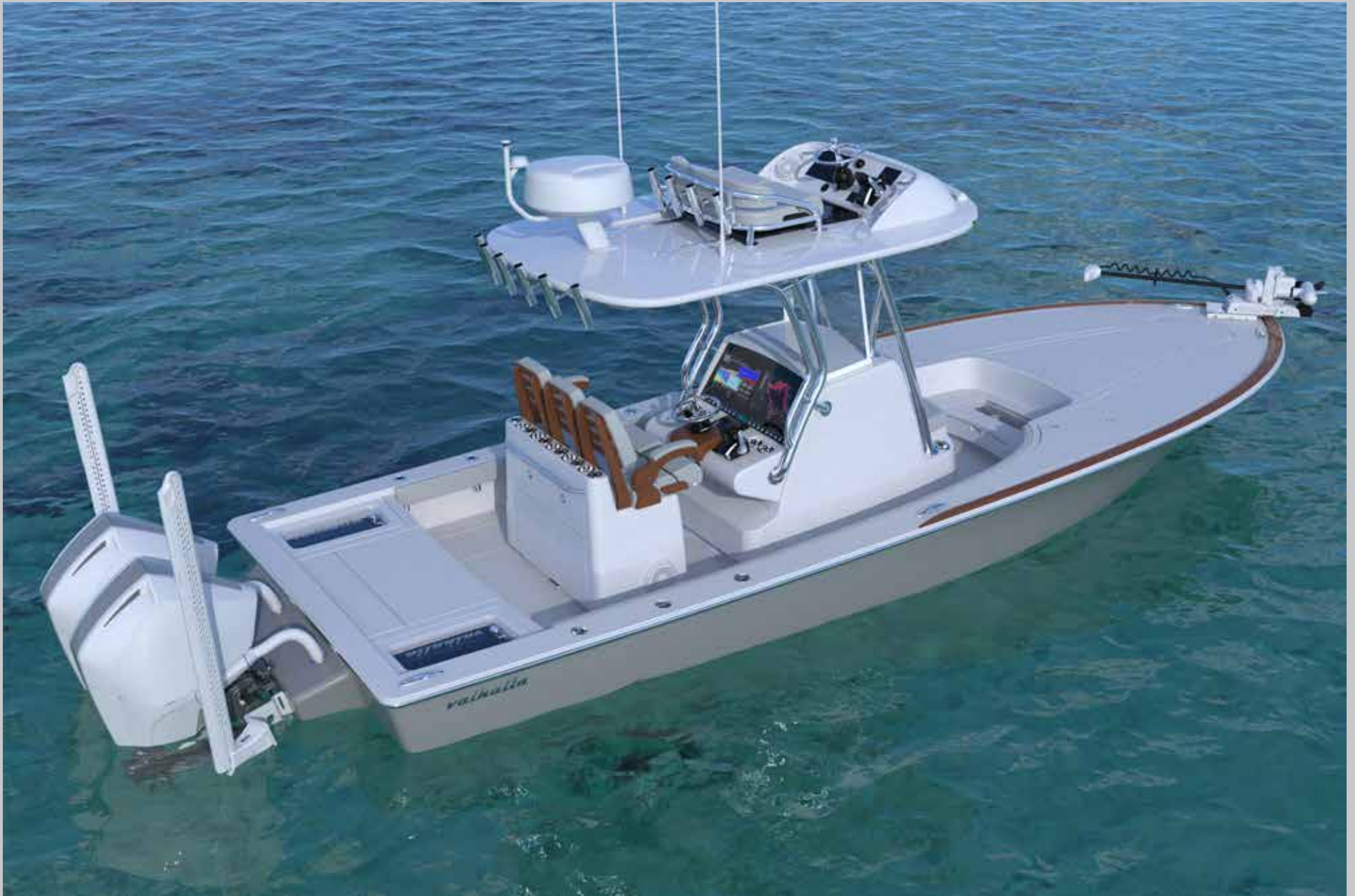
Stand-on Console Second Station