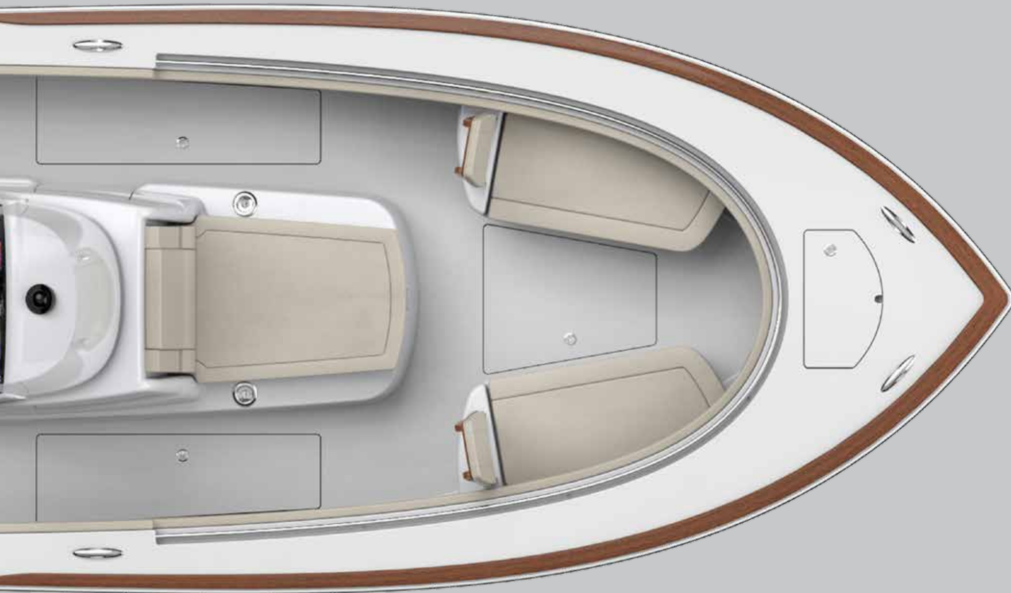
Standard Deck Arrangement with Optional Forward and Helm Seating